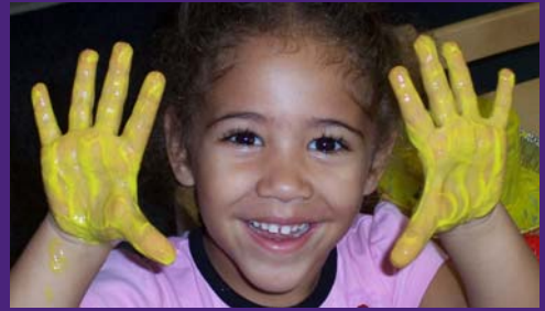
2008 Results Recognition Event